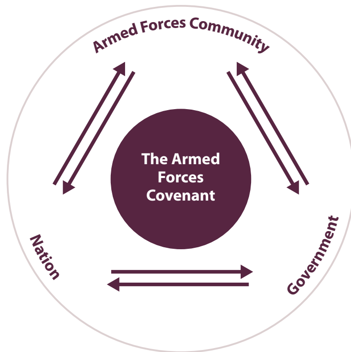
Figure 1: The Covenant Diagram

This document accompanies the Armed Forces Covenant and provides guidance on how it is to be put into effect, by describing: