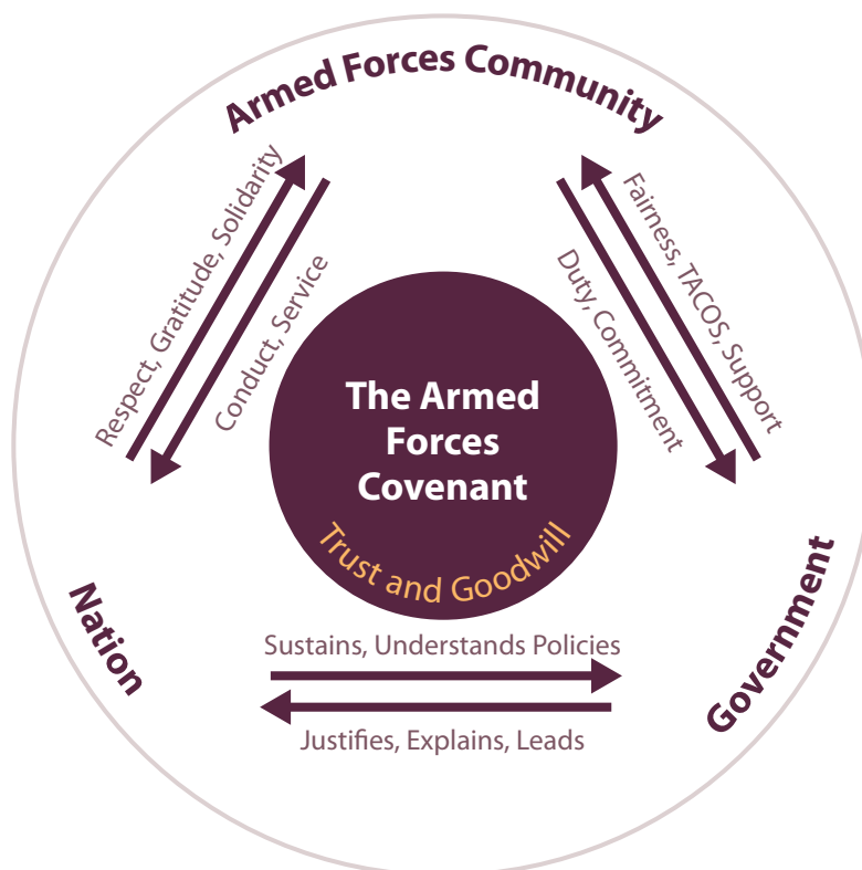
Figure 4: Obligations

These obligations do not require detailed explanation, but it is possible to derive from them a number of additional principles, which should similarly govern the actions of the Nation, the Government and the Armed Forces Community.